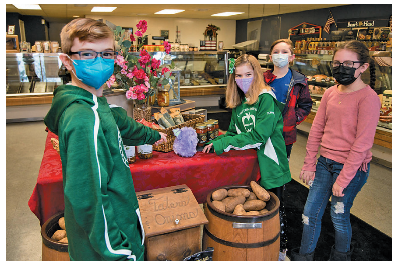
Above: Lew-Port elementary students look for the magical creature. • Below, One student found a magical creature.

River Region businesses offering special incentives